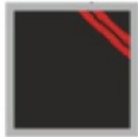
RT - 2 Black with Red