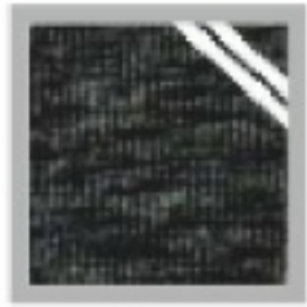
RT - 11 Black Melange with White