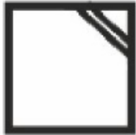
RT - 6 White with Black