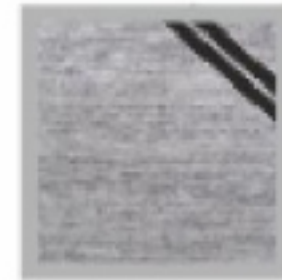
RT - 4 Grey Melange with Black