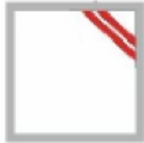
RT - 7 White with Red