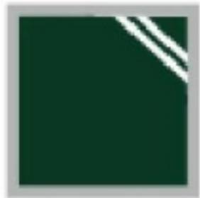
RT - 16 Bottle Green with White