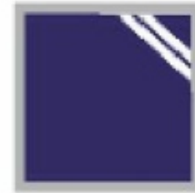
RT - 9 Navy Blue with White