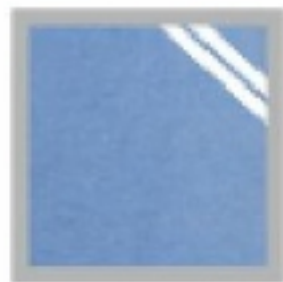
RT - 27 Light Denim with White