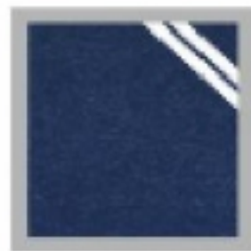
RT - 28 Denim with White