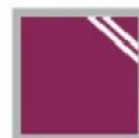
RT - 24 Magenta with White