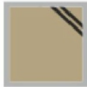
RT - 18 Beige with Black