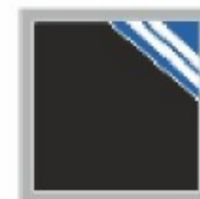
RT - 25 Electric Blue with White