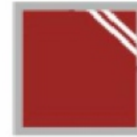
RT - 15 Maroon with White