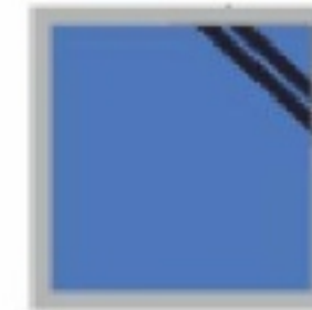
RT - 20 Sky Blue with Navy