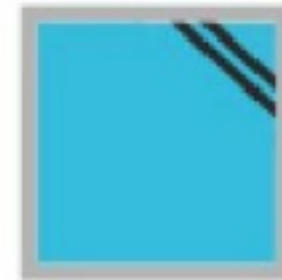
RT - 19 Ocean Blue with Black