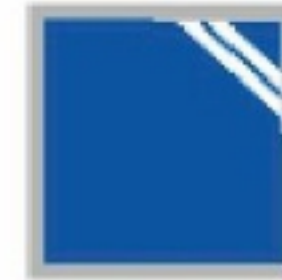
RT - 10 Turquoise Blue with White