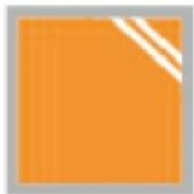
RT - 26 Tangerine with White