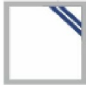
RT - 8 White with Royal Blue