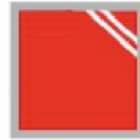
RT - 14 Red with White