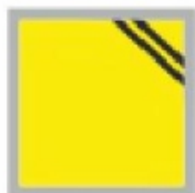
RT - 22 Sunflower Yellow with Black