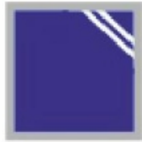
RT - 12 Royal Blue with White