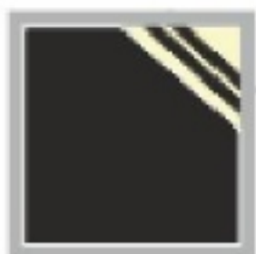
RT - 21 Cream with Black