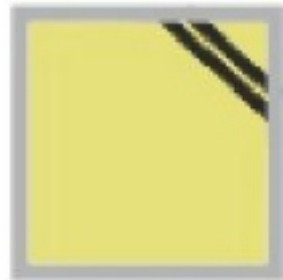
RT - 17 Lemon Yellow with Black