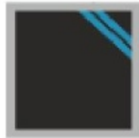
RT - 3 Black with Electric Blue