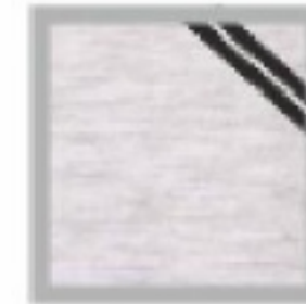
RT - 5 White Melange with Black