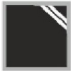
RT - 1 Black with White