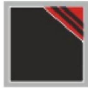
RT - 13 Red With Black