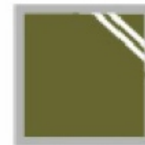
RT - 30 Military Green with White