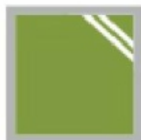
RT - 23 Green Apple with White